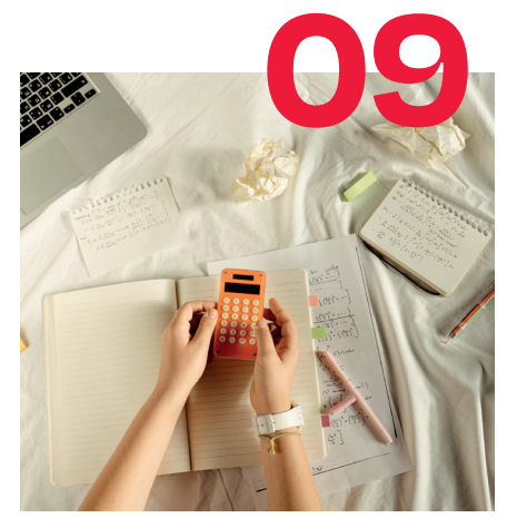
Working Time Unemployment benefit

Recreational leave Extraordinary leave Parental leave Leave for family reasons Family hospice leave Other leaves