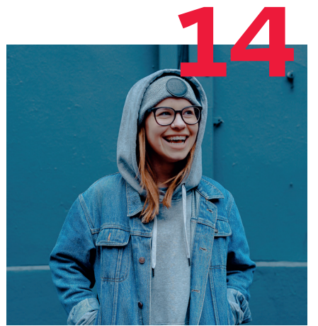
Protection of young workers Minimum social wage