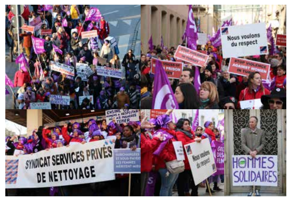
→ Vignette N°3:

It is essential to have a Women's department within the OGBL because the Department facilitates networking, whether within the OGBL or outside the OGBL, with feminist movements. The importance of networking will be discussed in more detail below.